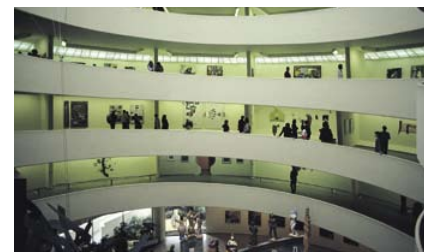
DMW19 is suitable for demanding building automation and other wall mount indoor dewpoint measurements.

The accuracy of the transmitter is simple to check on-site using the Vaisala HUMICAP® Hand-Held Humidity and Temperature Meter HM70.