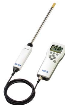
The Vaisala HUMICAP® Hand-Held Humidity and Temperature Meter HM70 is an easy and fast way to confirm the performance of DMW19 on site.