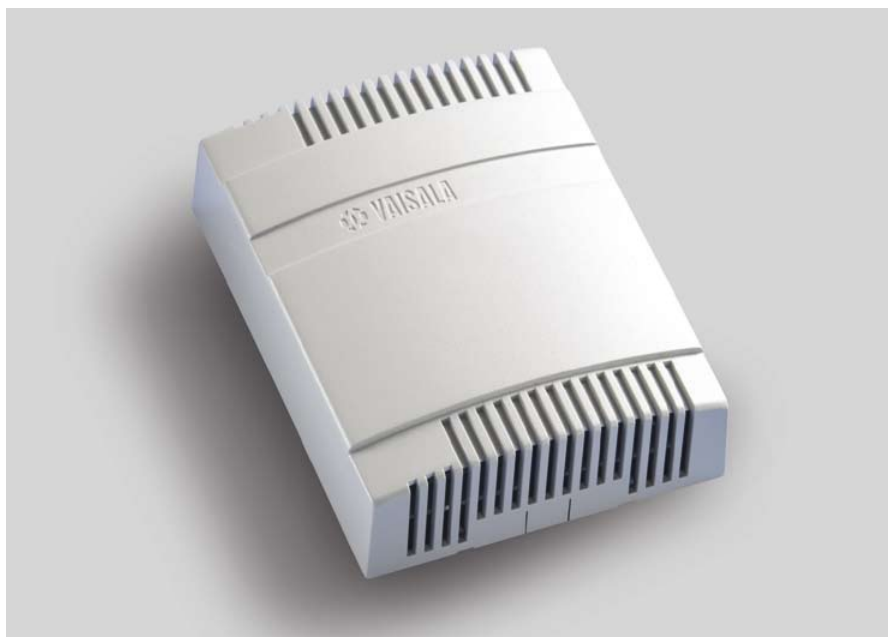
Vaisala HUMICAP® Dewpoint Transmitter DMW19 is a compact wall mount dewpoint transmitter.