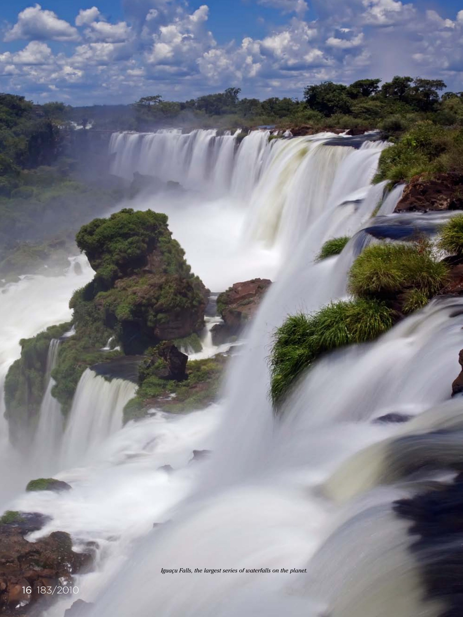
Iguaçu Falls, the largest series of waterfalls on the planet.